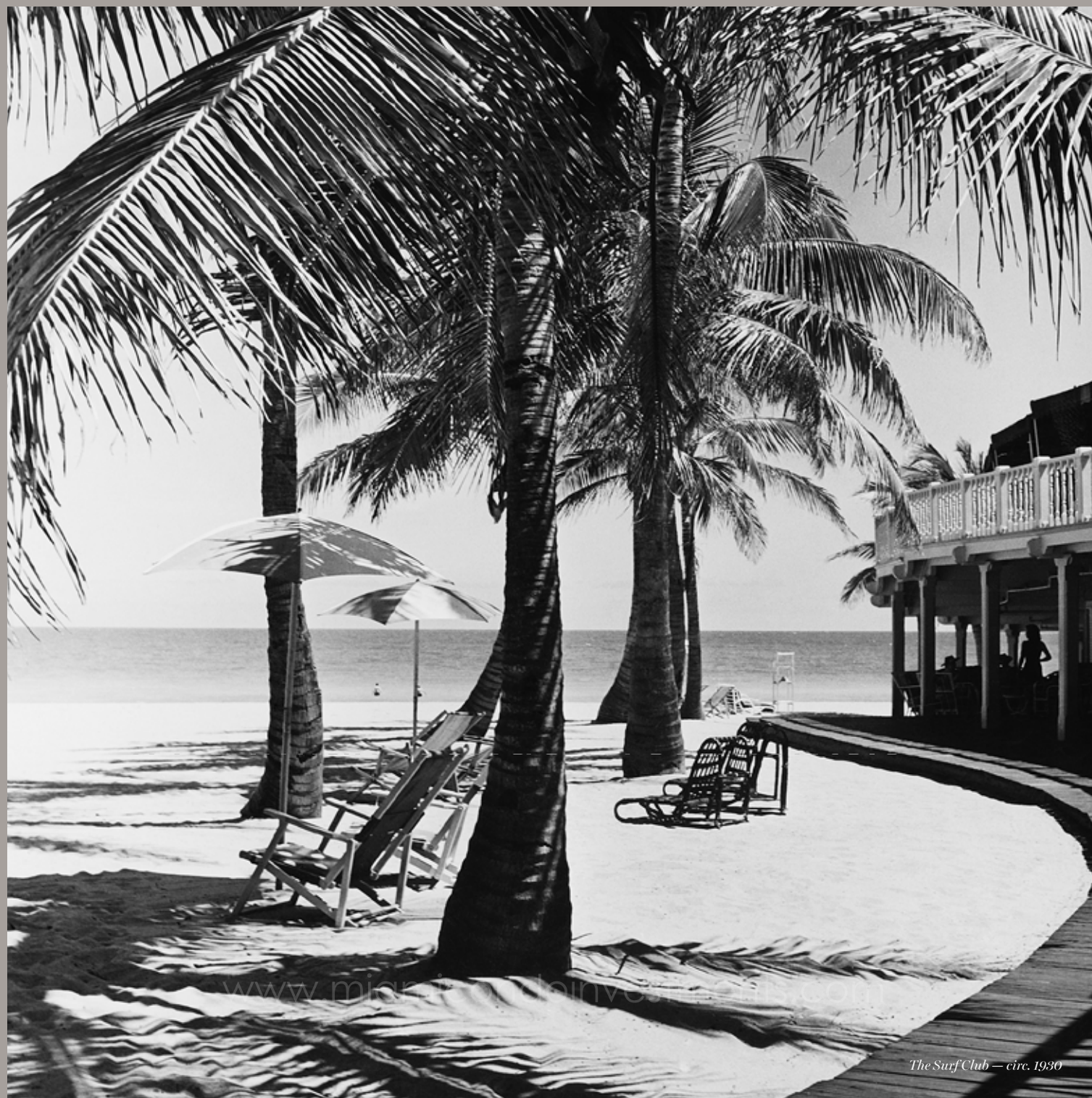
The Surf Club — circ. 1930