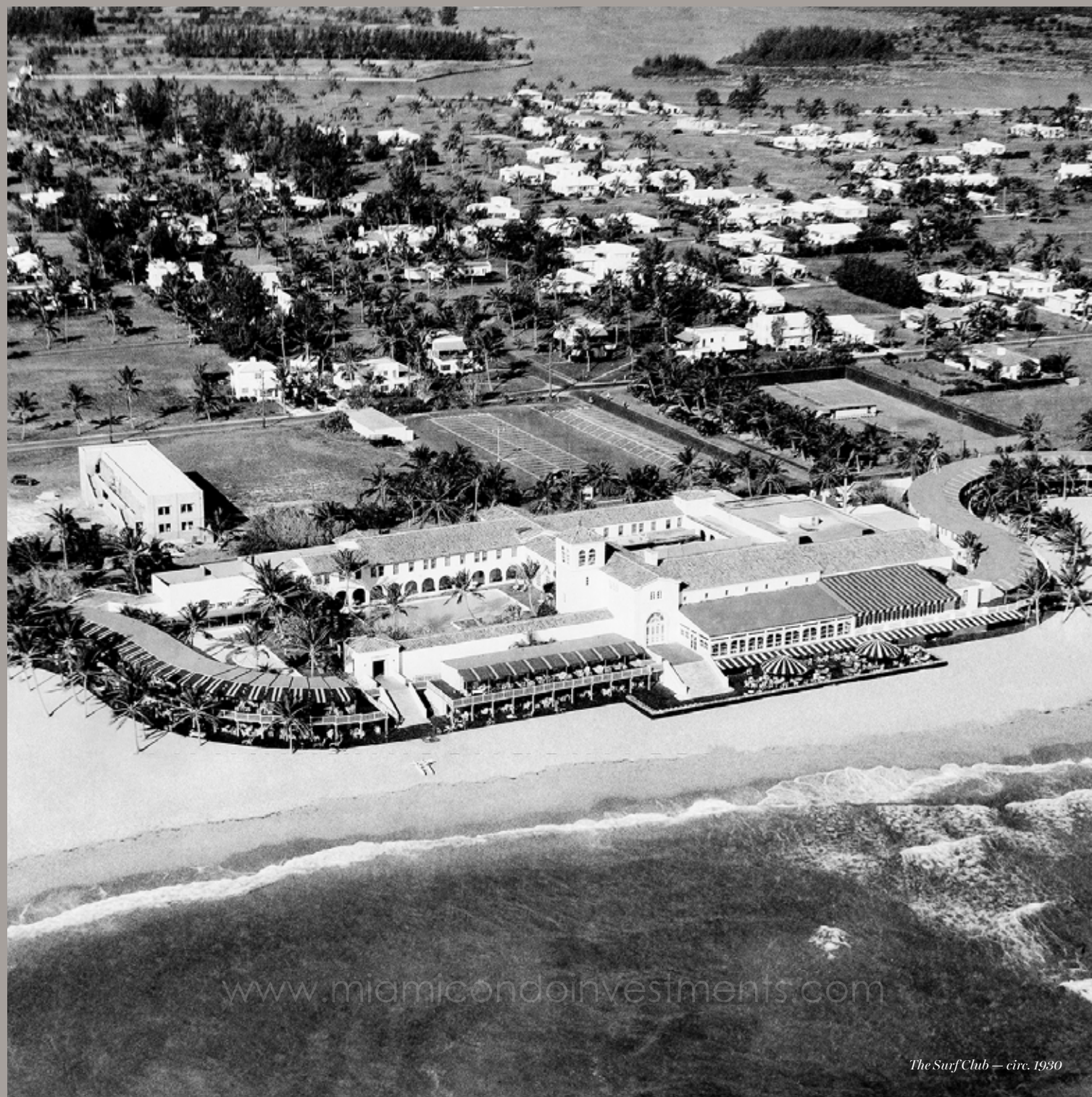
The Surf Club — circ. 1930